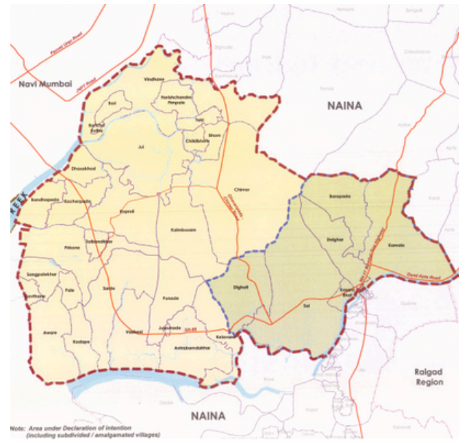
Plan Showing Boundary of Khopta New Town Notified Area (KNTNA) Accompaniment of Declaration of Intention for Revision of Sanctioned Development Plan of 6 villages & to prepare Development Plan of 26 villages of Khopta New Town Notified Area u/s 23(1) read with section 38 of M.R. & T.P. Act, 1966